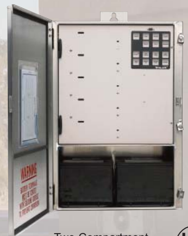
Two Compartment Electronics Cabinet